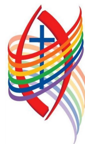
Crest of Affirm United

Comox United Church is a faith community within the United Church of Canada. Our central values appear at the bottom of this page. We are one of over 300 Affirming United Church Ministries across Canada, which means we affirm, include, and celebrate people of every age, race, belief, culture, ability, income level, family configuration, gender, gender identity, and sexual orientation in the life and ministry of our church, and proudly display the crest of the association of affirming churches known as Affirm United.